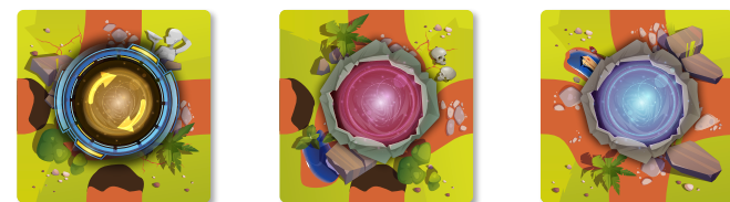
Rotation Platform Red Portal Blue Portal

Heroes can rotate the Rotation Platform card as many times as they wish as long as they are on the card. Rotating the card does not count as a move. Heroes can travel through the Blue or Red Portal cards both ways as much as they wish as long as they are on the card. A Hero cannot travel from a Blue Portal to a Red Portal. Travelling through